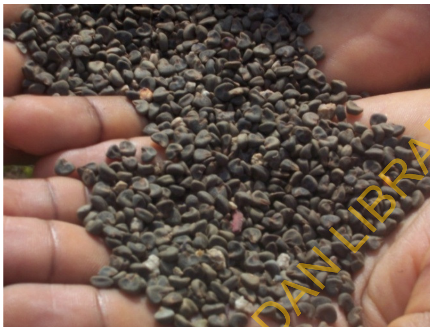
Figure 1. Seeds of H. sabdariffaba ready for planting.