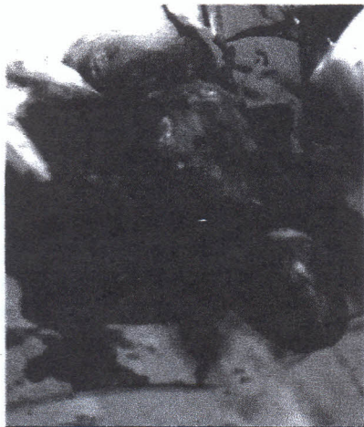
Figure 1: Excision of dorsal and lateral Peyronie's plaque.

2. A 60 year old man, being investigated for lower urinary tract symptoms, presented with two years history of lump of increasing size underneath the penis. The lump was initially painless but later became painful and eventually adversely affected his sexual life.